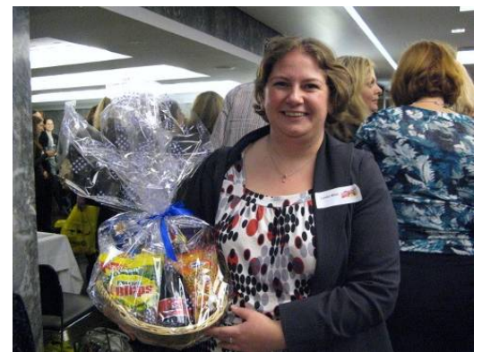
Below: SANZA gift hamper spot door prize winner

A reminder that the New Zealand Society is run by volunteer members for other members and their friends. Would you like to join the NZ Society committee, or lend a hand at an event? Offers of help are gratefully received via nzsociety@nzsociety.co.uk or by chatting to one of the committee at any of our events.