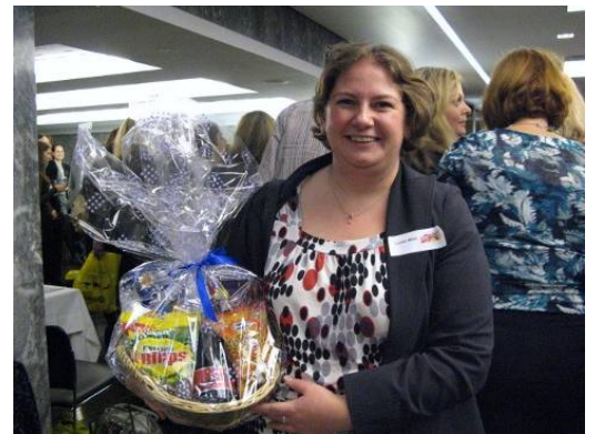
Below: SANZA gift hamper spot door prize winner

A reminder that the New Zealand Society is run by volunteer members for other members and their friends. Would you like to join the NZ Society committee, or lend a hand at an event? Offers of help are gratefully received via nzsociety@nzsociety.co.uk or by chatting to one of the committee at any of our events.